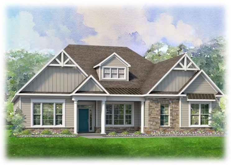
Elevation B - Stone

For all elevations, side and front entry garages vary by community.