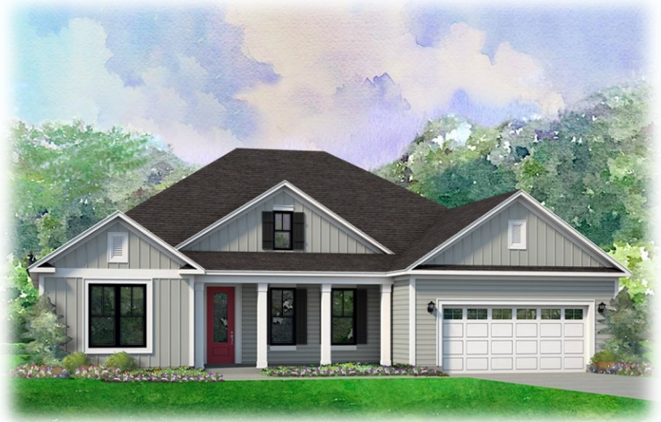
Elevation B- Farmhouse