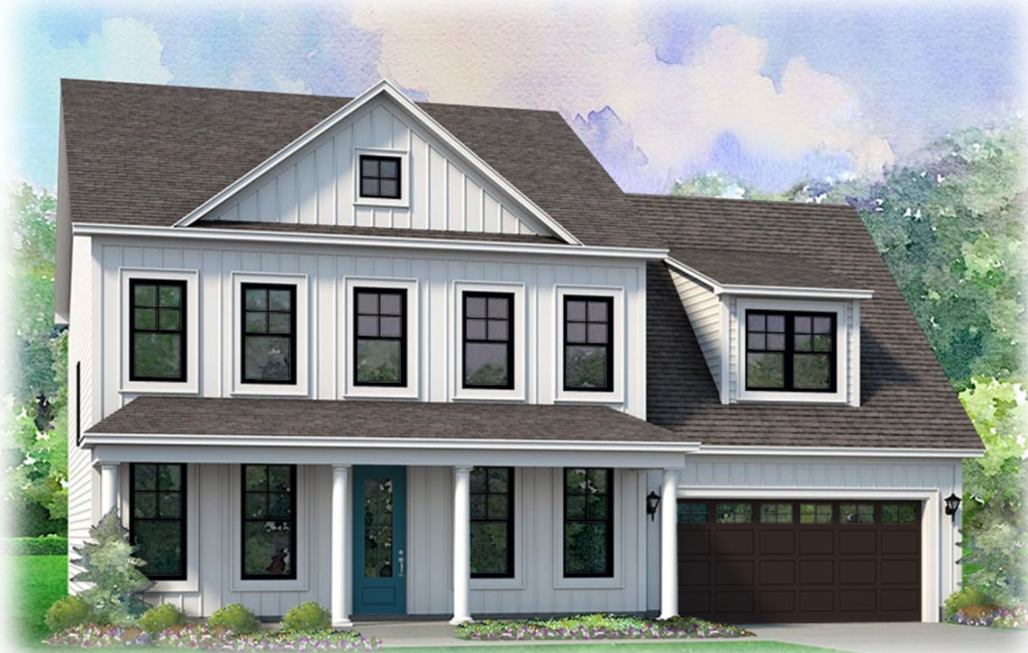
Elevation A - Farmhouse