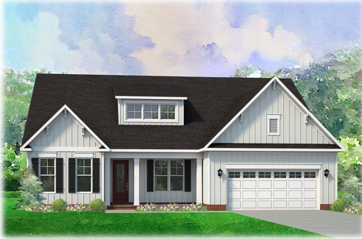
Elevation B Farmhouse