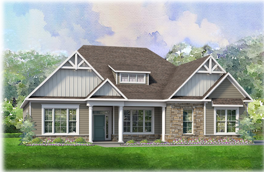
Elevation B – stone accents