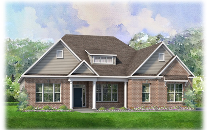
Elevation B - brick