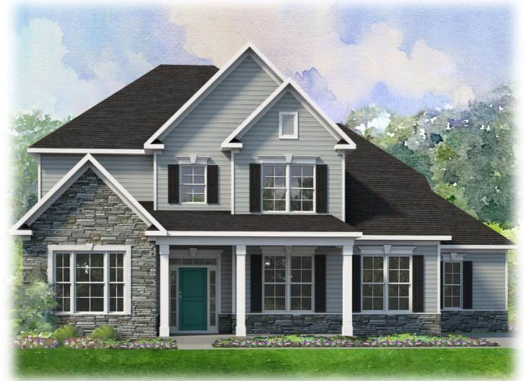
Elevation A - stone

Note: Exterior detail and trim may vary. Rendering is an artistic interpretation and may not be exact.