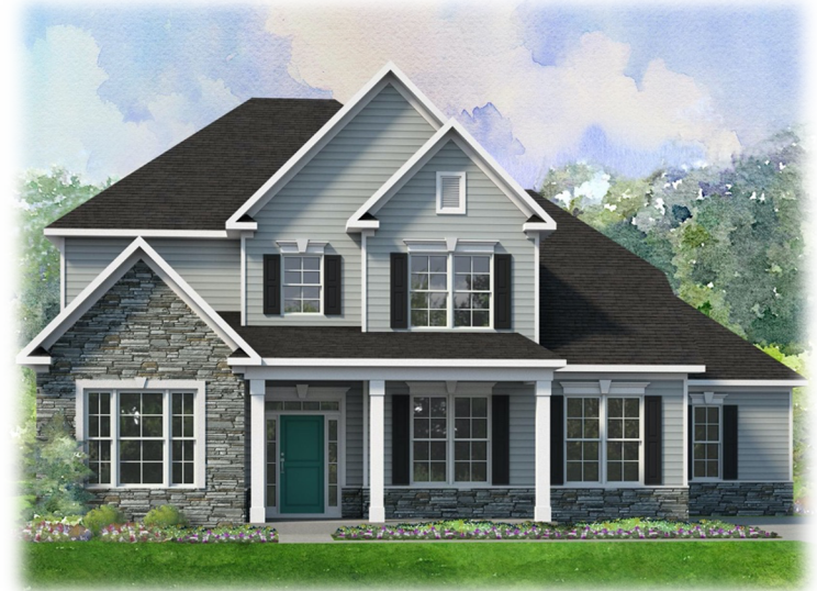
Elevation A - Stone