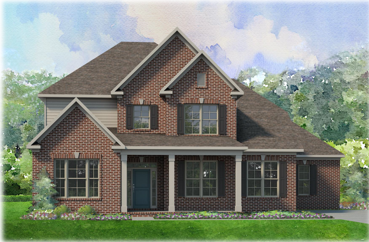
Elevation A - Brick